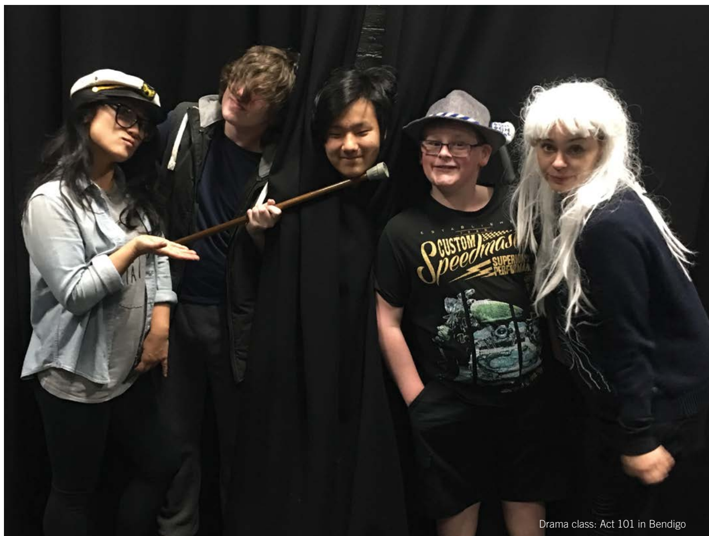
Drama class: Act 101 in Bendigo

Our adaptation of the Tree of Life program aims to build connections and confidence in children and teenagers who have formed families through permanent care and adoption. Facilitators and volunteer mentors of this program include adult adoptees and intercountry adoptees. Due to the success of this program and the commitment and generosity of our volunteers, PCA Families has secured additional funding from the R.E.Ross Trust and the Montana Foundation to deliver the Tree of Life program in regional Victoria in 2017.